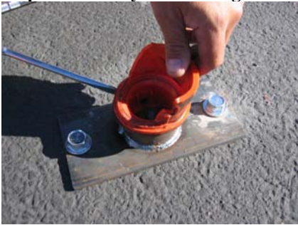
Step 4: Remove the old hinge section.