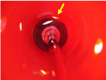
View looking inside the hinge tube. Flat is lined up with the hole.