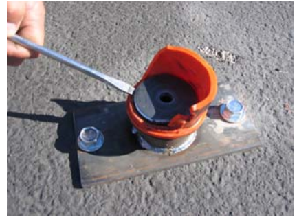
Step 3: Remove the hold-down disc.