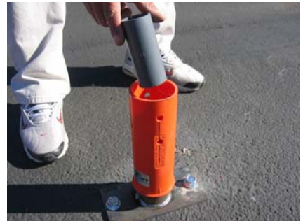
Step 7: Drop the inner tube into the hinge tube.