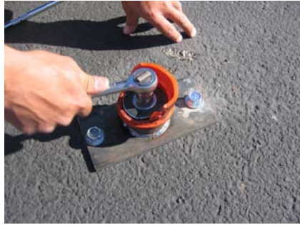
Step 2: Remove the 1/2" center bolt.