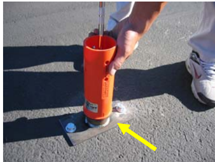
Step 6: Align the hinge tube index mark as shown and tighten the 1/2" bolt.