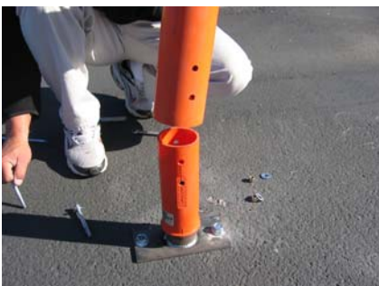
Step 8: Place the post on the hinge.