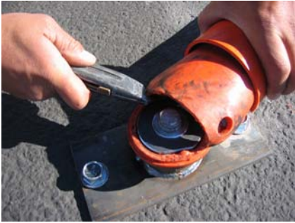
Step 1: Cut away the old hinge tube.