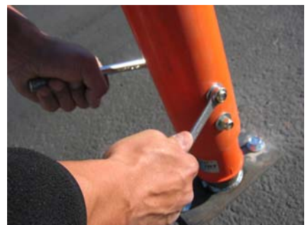
Step 10: Tighten the nuts until they are flush with the bolt end.