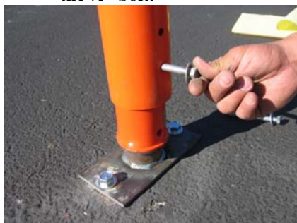
Step 9: Install the 3/8" x 4" bolts, flat washers and locking nuts.