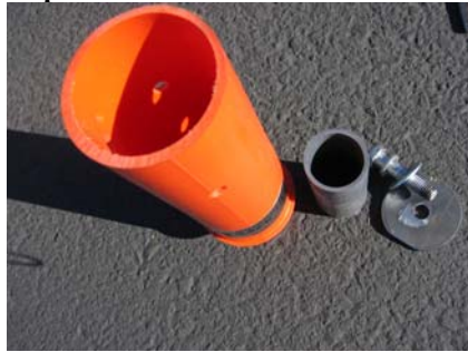
Hinge Section Parts: left to right – hinge tube, inner tube, hold-down disc with 1/2" bolt and washers.