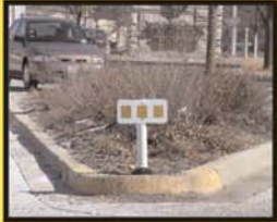
The K-Marker is 3"x18" with a 15"x6" horizontal panel containing three 3" squares of high intensity reflective sheeting arranged horizontally on the front