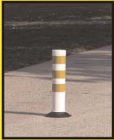
The Q-Marker is 4" x 24" with three" bands of high intensity reflective sheeting.