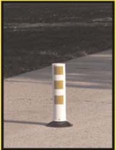
4"x21" post with three squares of high intensity reflective sheeting arranged vertically on the front side and one 3" square on the back.