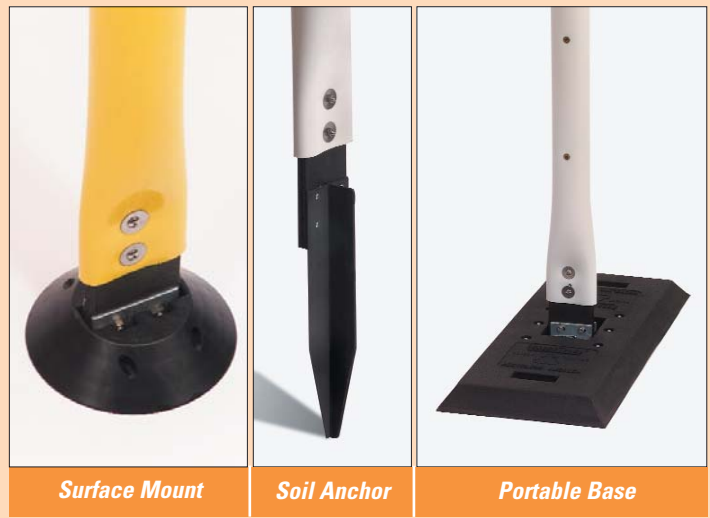
Surface Mount Soil Anchor Portable Base